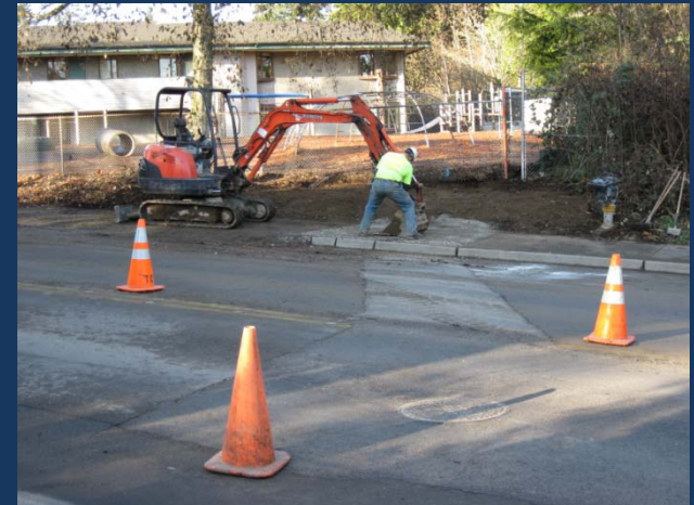
Sewer construction work at S. 316 th St.