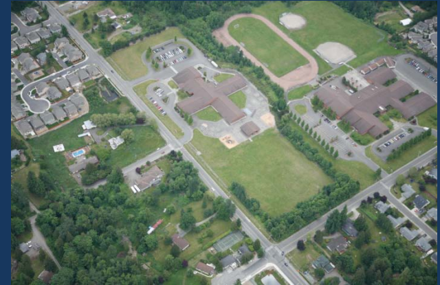
Aerial view of Hazelwood Elementary and Rainier Middle School.