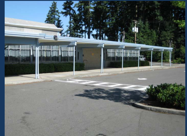
Front entry at Chinook Elementary School where wood roof decking will be replaced.