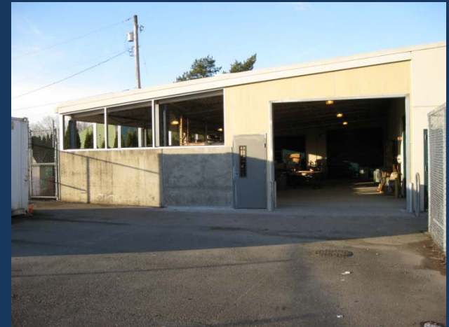
New wall installed at AHS Auto Shop.