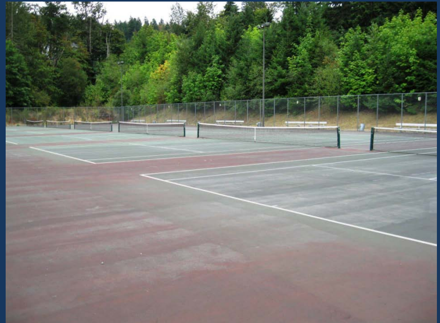
Existing tennis courts at Auburn Riverside High School.