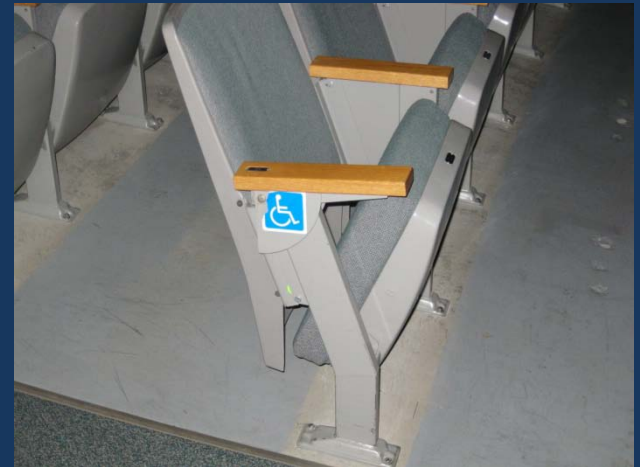
New ADA signage at Auburn PAC.