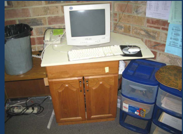
Existing computer table at Cascade MS.