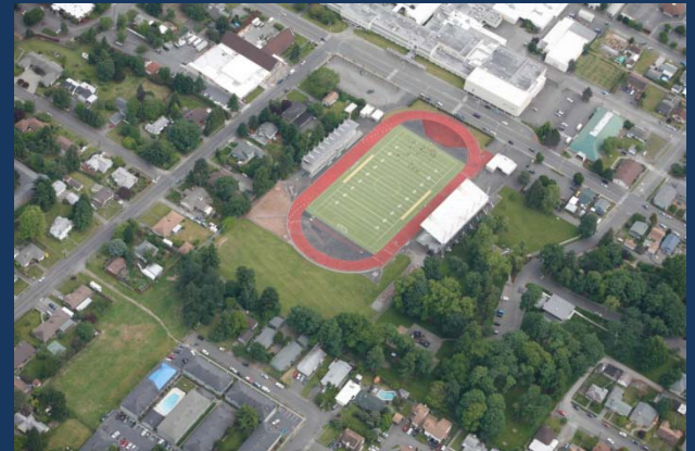
Aerial view of Auburn pool and stadium.