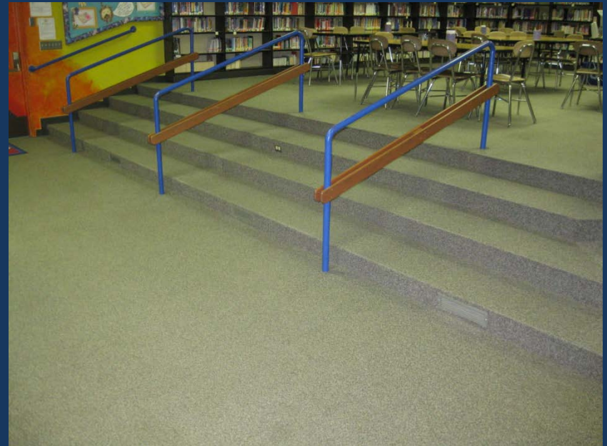
Existing carpet in library at Dick Scobee Elementary School.