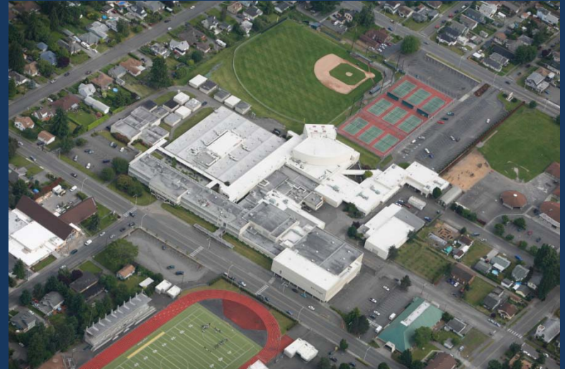
Aerial view of Auburn High School.