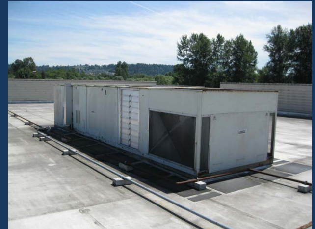
Existing air handling unit at Alpac Elementary School.