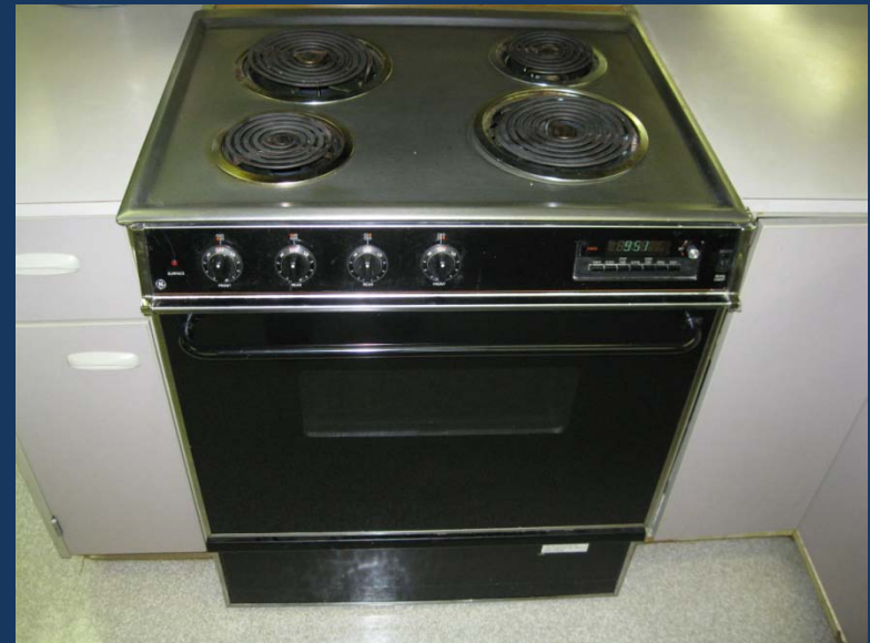
Twenty-year old electric range that will be replaced at Foods Classroom at Rainier Middle School.