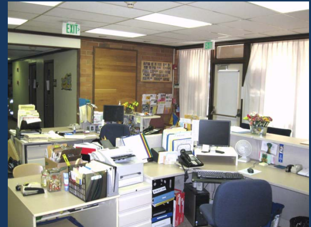
Gildo Rey Elementary main office where new telephones will be installed.