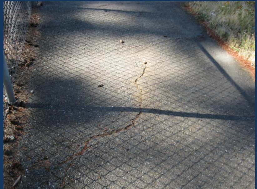
Damaged asphalt walkway at Chinook Elementary School.