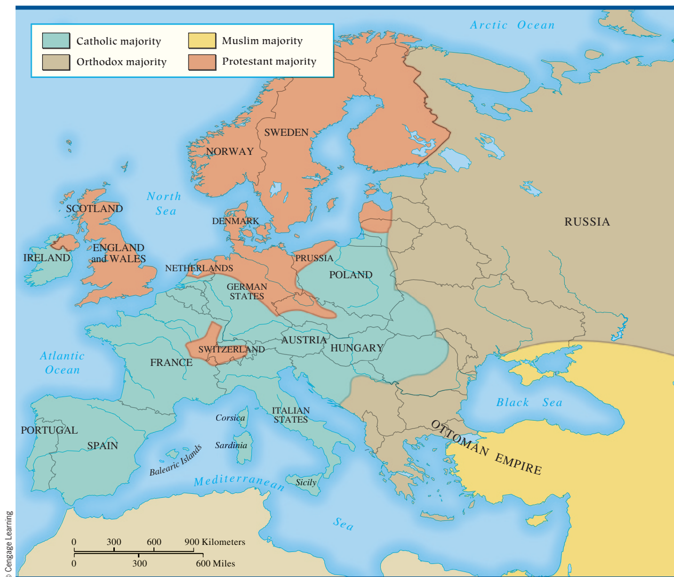
MAP 17.2 Religious Populations of Eighteenth-Century Europe. Christianity was still a dominant force in eighteenth-century Europe—even many of the philosophes remained Christians while attacking the authority and power of the established Catholic and Protestant churches. By the end of the century, however, most monarchs had increased royal power at the expense of religious institutions.

Q To what extent were religious majorities geographically concentrated in certain areas, and what accounted for this?