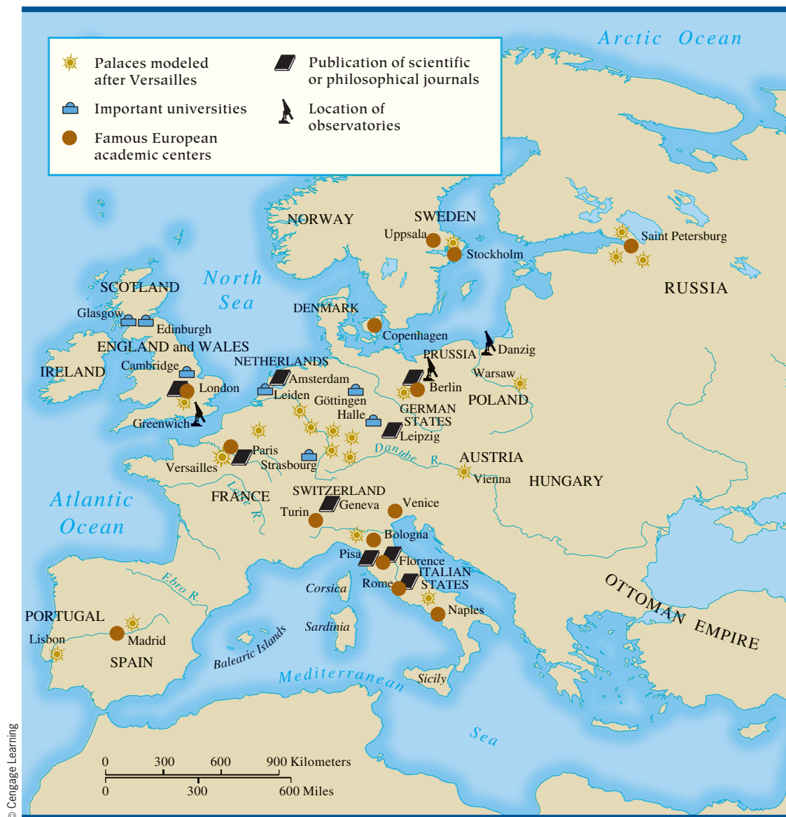
MAP 17.1 The Enlightenment in Europe. “Have the courage to use your own intelligence!” Kant’s words epitomize the role of the individual in using reason to understand all aspects of life—the natural world and the sphere of human nature, behavior, and institutions.

Q Which countries or regions were at the center of the Enlightenment, and what could account for peripheral regions being less involved?