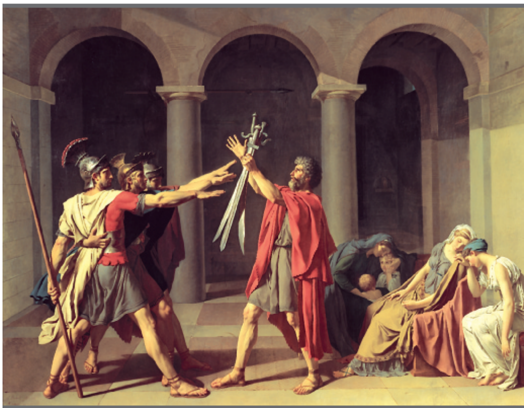
Jacques-Louis David, Oath of the Horatii . The Frenchman Jacques-Louis David was one of the most famous Neoclassical artists of the late eighteenth century. To immerse himself in the world of Classical antiquity, he painted the Oath of the Horatii in Rome. Thanks to its emphasis on patriotic duty, the work became an instant hit in both Paris and Rome.