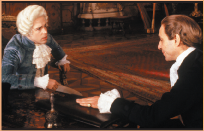
Mozart (Tom Hulce) meets with Salieri (F. Murray Abraham).

Amadeus is a brilliant film about brilliance—the musical genius of Mozart. While the movie is accurate in presenting