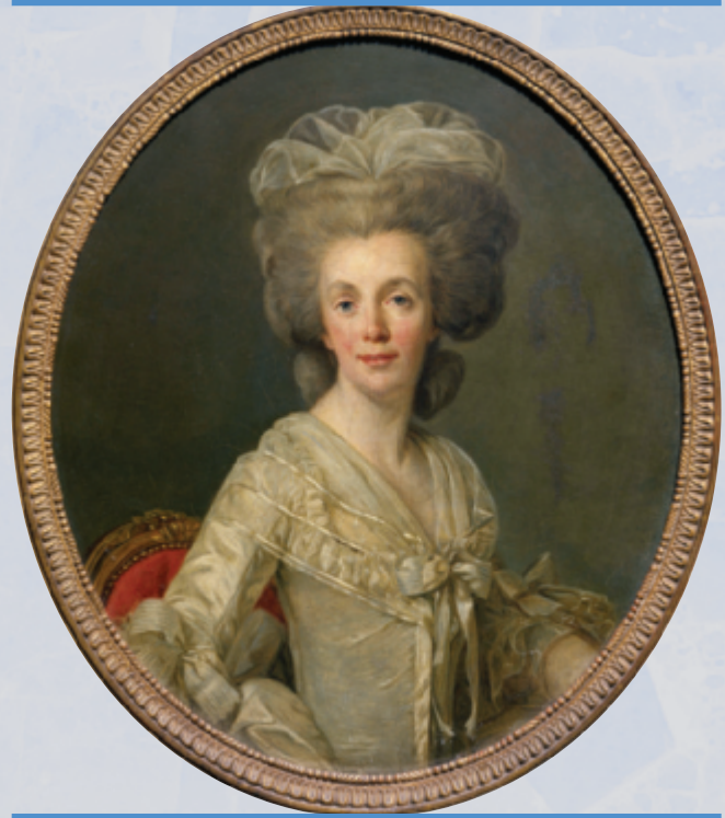
Châteaux de Versailles et de Trianon, Versailles