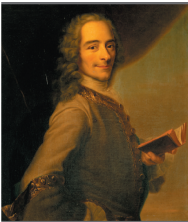
Voltaire. François-Marie Arouet, better known as Voltaire, achieved his first success as a playwright. A philosophe, Voltaire was well known for his criticism of traditional religion and his support of religious toleration. Maurice-Quentin de La Tour painted this portrait of Voltaire holding one of his books in 1736.

Châteaux de Versailles et de Trianon