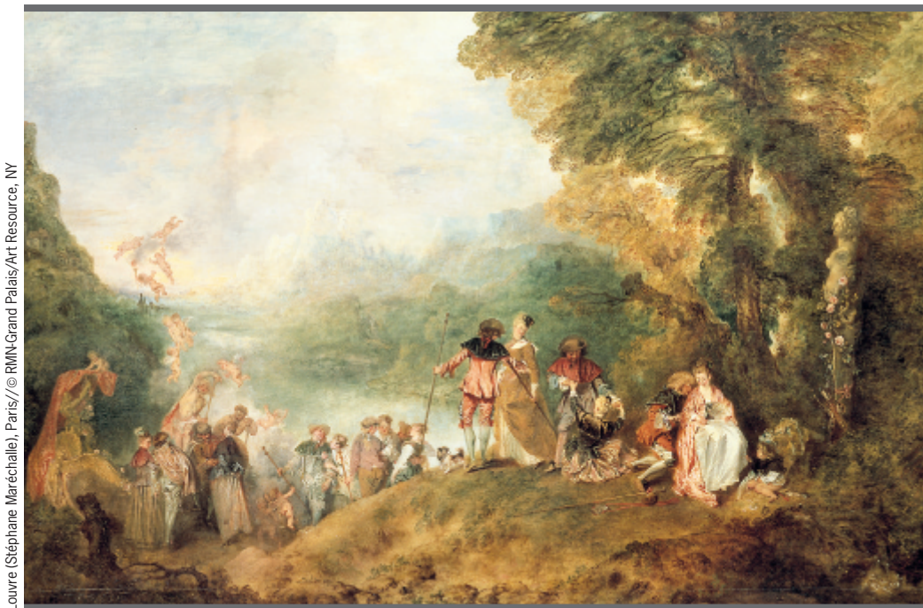
Antoine Watteau, Return from Cythera . Antoine Watteau was one of the most gifted painters in eighteenth-century France. His portrayal of aristocratic life reveals a world of elegance, wealth, and pleasure. In this painting, which is considered his masterpiece, Watteau depicts a group of aristocratic lovers about to depart from the island of Cythera, where they have paid homage to Venus, the goddess of love. Luxuriously dressed, they move from the woodlands to a golden barge that is waiting to take them from the island.

Neumann's two masterpieces are the pilgrimage church of the Vierzehnheiligen (feer-tsayn-HY-li-gen) (Fourteen Saints)