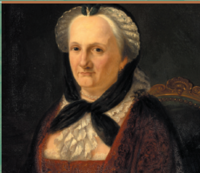
Portrait of Madame Geoffrin