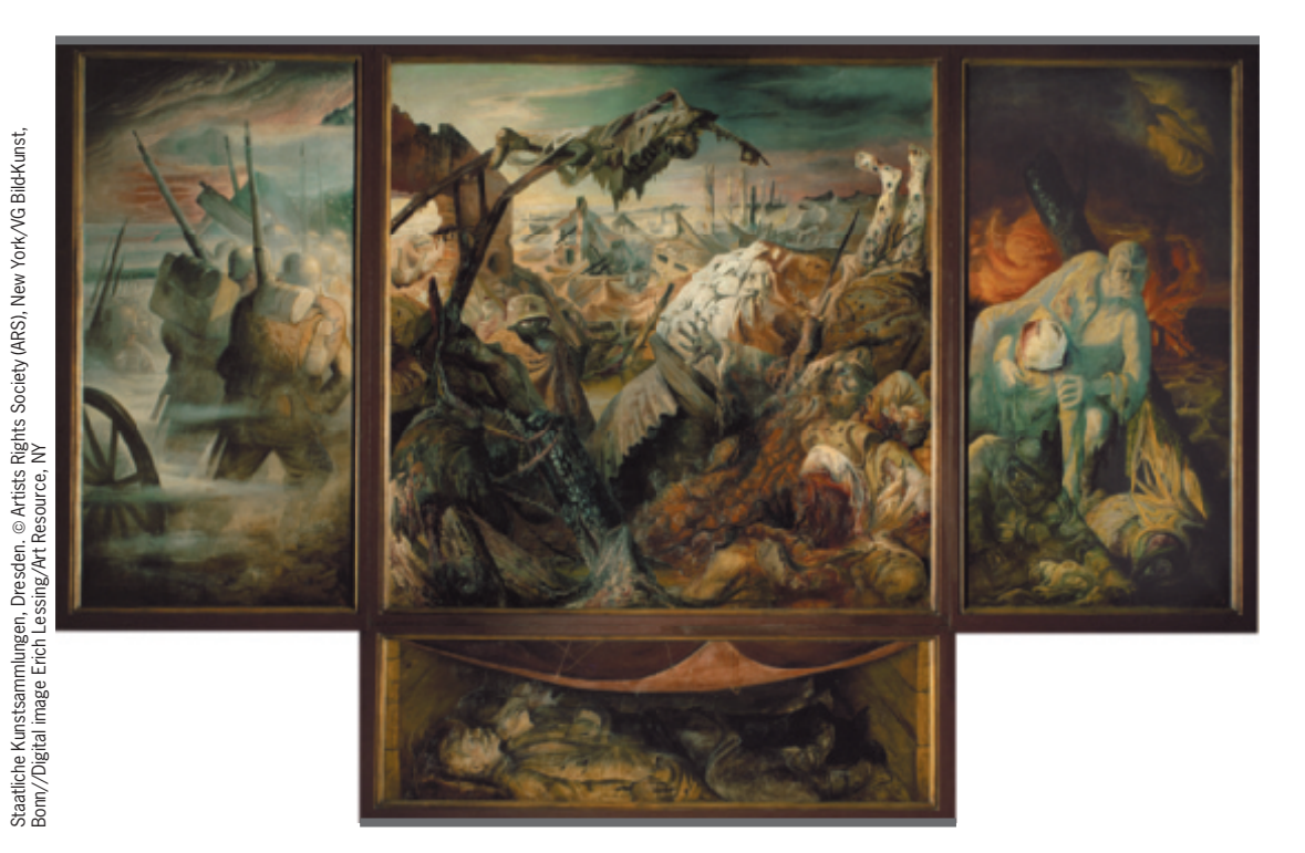
Otto Dix , The War . In The War , Otto Dix used the traditional format of a triptych—a three-paneled painting usually used as an altarpiece—to demonstrate the devastating effects of World War I. In the left panel, soldiers march off to battle, while the center and right panels show the battle's result—contorted and mutilated bodies riddled with bullets. The coffinlike bottom panel is filled with dead soldiers. Dix portrayed himself in the right panel as a ghostlike soldier towing a fellow soldier from the battlefield.