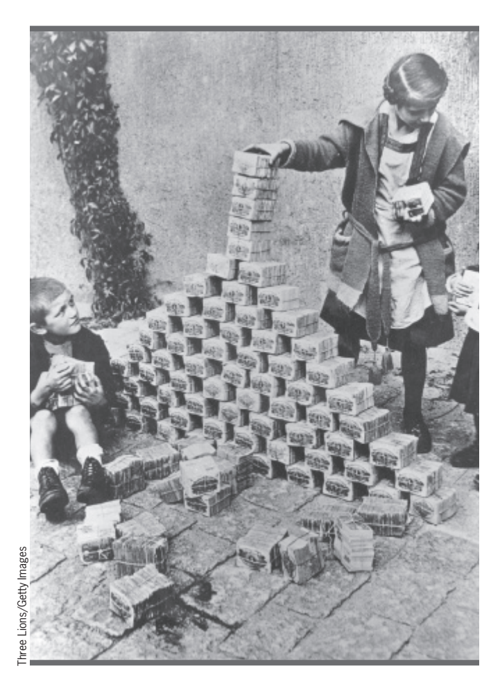
The Effects of Inflation. The inflationary pressures that had begun in Germany at the end of World War I intensified during the French occupation of the Ruhr. By the early 1920s, the value of the German mark had fallen precipitously. This photograph shows German children using bundles of worthless money as building blocks. The wads of money were cheaper than toys.

Both Germany and France suffered from the French occupation of the Ruhr. The German government adopted a policy of passive resistance that was largely financed by printing more paper money, but this only intensified the inflationary pressures that had already appeared in Germany by the end of the war. The German mark soon became worthless. In 1914, a dollar was worth 4.2 marks; by November 1, 1923, the rate had reached 130 billion marks to the dollar, and by the end of November, it had snowballed to an incredible 4.2 trillion marks to the dollar. Economic disaster fueled political upheavals as Communists staged uprisings in October 1923, and Adolf Hitler's band of Nazis attempted to seize power in Munich in November (see "Hitler and Nazi Germany" later in this chapter). But the French were hardly victorious. Their gains from the occupation were not enough to offset the costs. Meanwhile, pressure from the United States and Great Britain forced the French to agree to a new conference of experts to reassess the reparations problem. By the time the conference did its work