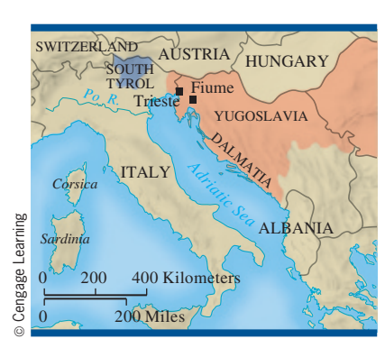
Territory Gained by Italy

IMPACT OF WORLD WAR I As a new European state after 1861, Italy faced a number of serious problems that were only magnified when it became a belligerent in World War I. An estimated 700,000 Italian soldiers died, and the treasury reckoned