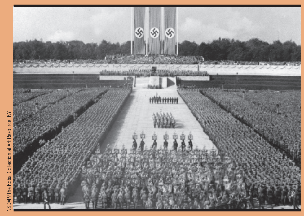
A scene from Triumph of the Will showing one of the many mass rallies at Nuremberg.

The rest of the film is devoted to scenes from the six days of the party rally: the dramatic opening when Hitler is greeted with thunderous applause; the major speeches of party leaders; an outdoor rally of Labor Service men who perform pseudo-military drills with their shovels; a Hitler Youth rally in which Hitler tells thousands of German boys, "in you Germany will live"; military exercises; and massive ceremonies with thousands of parading SA and SS men.