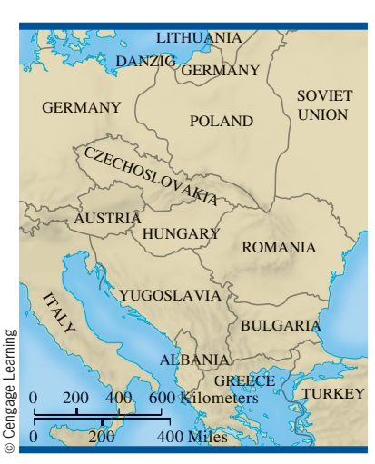
Eastern Europe After World War I

Nowhere had the map of Europe been more drastically altered by World War I than in eastern Europe. The new