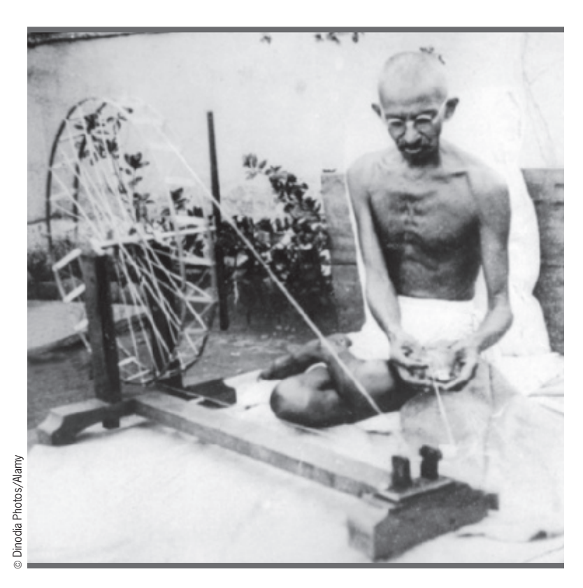
Gandhi. Mahatma Gandhi, India's "Great Soul," became the spiritual leader of India's struggle for independence from British colonial rule. Unlike many other nationalist leaders, Gandhi rejected the materialistic culture of the West and urged his followers to return to the native traditions of the Indian village. To illustrate his point, as seen in this illustration, Gandhi dressed in the simple Indian dhoti rather than in the Western fashion favored by many of his colleagues. He is also using a manual spinning wheel to make cotton thread to protest imports of British textiles.

rising tide of unrest against European political domination began to emerge in Asia and Africa and led to movements for change.