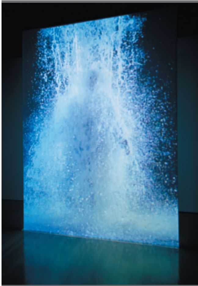
Bill Viola, The Crossing, 1996. Two-channel video and sound installation, continuous loop 16 feet × 27 feet 6 inches × 57 feet (4.9 × 8.4 × 17.4 m) Solomon R. Guggenheim Museum (2000.61), New York. Gift, The Bohen Foundation, 2000.

THE BODY AND IDENTITY IN CONTEMPORARY ART By focusing on bodily experience and cultural norms, contemporary artists have attempted to restore some of what has been lost in the Digital Age. Kiki Smith (b. 1954), an American artist born in Germany, creates sculptures of the human body that often focus on anatomical processes. These works, commonly made of wax or plaster, question the politics surrounding the body, including AIDS and domestic abuse, while reconnecting to bodily experiences. Contemporary artists also continue to explore the interaction between the Western and non-Western world, particularly the multiculturalism generated by global migrations (see “The Social Challenges of Globalization” later in this chapter). For example, the art of Yinka Shonibare (YEEN-kuh SHOW-nih-bar-eh) (b. 1962), who was born in London, raised in Nigeria, and now resides in England, creates works that investigate the notion of hybrid identity. This is evident in his work, How to Blow Up Two Heads at Once (Gentlemen) , which depicts European Victorian figures dressed in Dutch wax cloth.