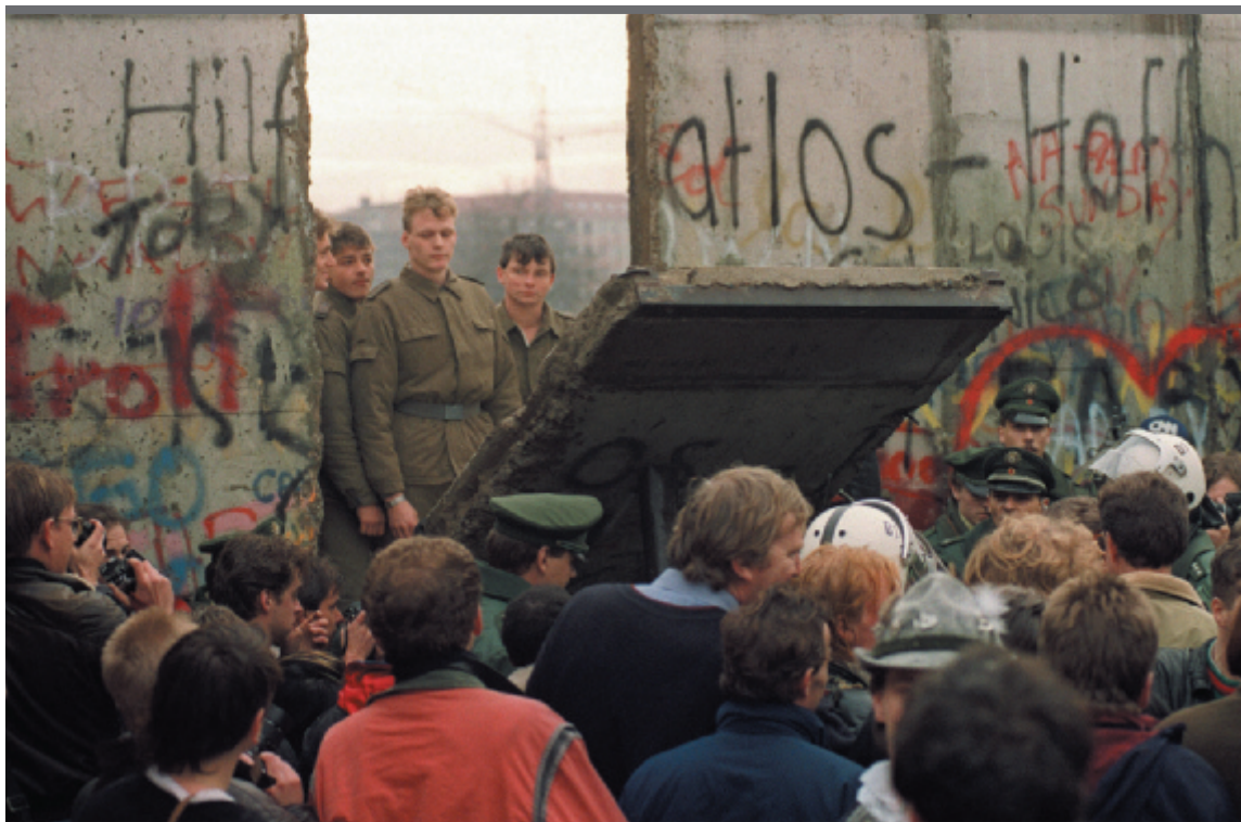
And the Wall Came Tumbling Down. The Berlin Wall, long a symbol of Europe’s Cold War divisions, became the site of massive celebrations after the East German government opened its border with the West. On November 11, East German border guards demolished a section of the wall to create a new crossing point. As seen in this photograph, West Germans celebrated the opening of the new crossing point.

Perhaps the most dramatic events took place in East Germany, where a persistent economic slump and the ongoing oppressiveness of the regime of Erich Honecker led to a flight of refugees and mass demonstrations against the regime in the summer and fall of 1989. After more than half a million people flooded the streets of East Berlin on November 4, shouting, “The wall must go!” the German Communist government soon capitulated to popular pressure and on November 9 opened the entire border with the West. Hundreds of thousands of Germans swarmed across the border, mostly to visit and return. The Berlin Wall, long a symbol of the Cold War, became the site of massive celebrations as thousands of people used sledgehammers to tear it down. By December, new political parties had emerged, and on March 18, 1990, in East Germany’s first free elections ever, the Christian Democrats won almost 50 percent of the vote.