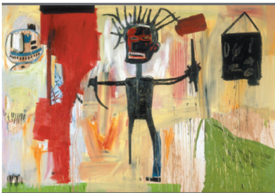
Jean-Michel Basquiat, Self Portrait (1986). In his paintings, Basquiat combined Abstract Expressionist brushwork with the popular culture of urban life. He dabbled with hip-hop and included references to comic book characters, jazz musicians, and sports heroes in his work.

Barcelona, Spain. © The Estate of Jean-Michel Basquiat/ADAGP, Paris/ARS, New York// Digital image Banque d'Images, ADAGP/Art Resource, NY