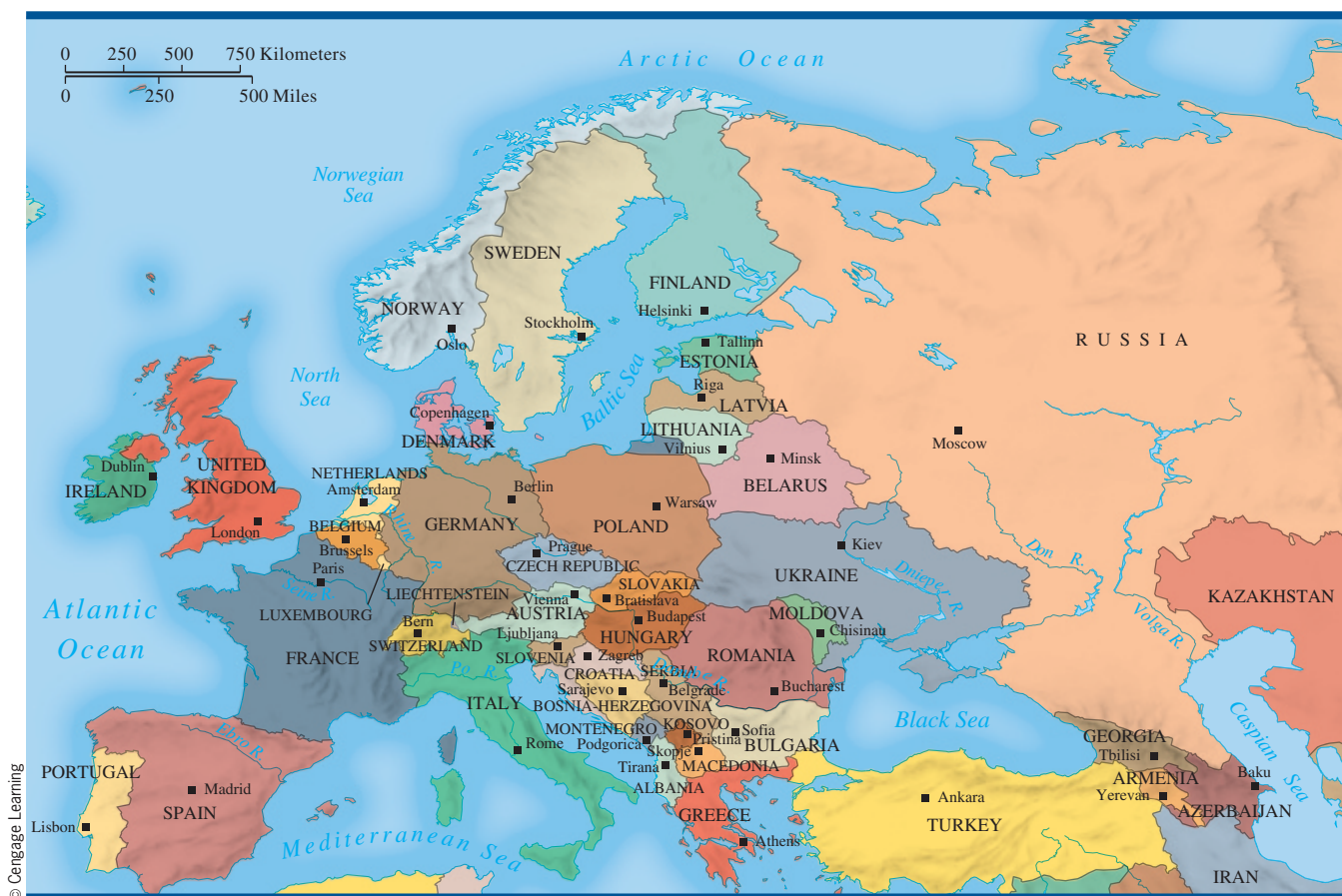
MAP 30.1 The New Europe. The combination of an inefficient economy and high military spending had led to stagnation in the Soviet Union by the early 1980s. Mikhail Gorbachev came to power in 1985, unleashing political, economic, and nationalist forces that led to independence for the former Soviet republics and also for Eastern Europe.

Q Compare this map with Map 28.1. What new countries had emerged by the early twenty-first century?