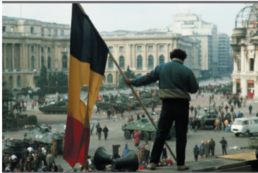
A Romanian Revolutionary. The revolt against Communist rule in Eastern Europe in 1989 came last to Romania. It was also more violent as the government at first tried to stem the revolt by massacring demonstrators. This picture shows a young Romanian rebel waving the national flag with the Communist emblem cut out of the center. He is on a balcony overlooking the tanks, soldiers, and citizens filling Palace Square in Bucharest.

Czechoslovakia's revolutionary path was considerably less violent than Romania's, where opposition grew as the dictator Nicolae Ceaușescu rejected the reforms in Eastern Europe promoted by Gorbachev. Ceaușescu's extreme measures to reduce Romania's external debt led to economic difficulties. Although he was successful in reducing foreign debt, the sharp drop in living standards that resulted from those hardship measures angered many Romanians. A small incident became the spark that ignited heretofore suppressed flames of discontent. The ruthless crushing of a demonstration in Timișoara in December 1989 led to other mass demonstrations.