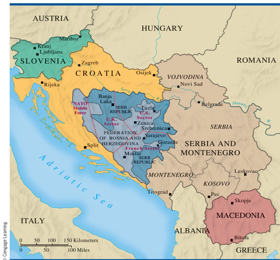
MAP 30.2 The Lands of the Former Yugoslavia, 1995. By 1991, resurgent nationalism and the wave of independence sweeping across Europe overcame the forces that held Yugoslavia together. Declarations of independence by Slovenia, Croatia, and Bosnia-Herzegovina led to war with the Serbian-dominated rump Yugoslavia of Slobodan Milošević.

Q What aspects of Slovenia's location help explain why its war of liberation was briefer and less bloody than others in the former Yugoslavia?