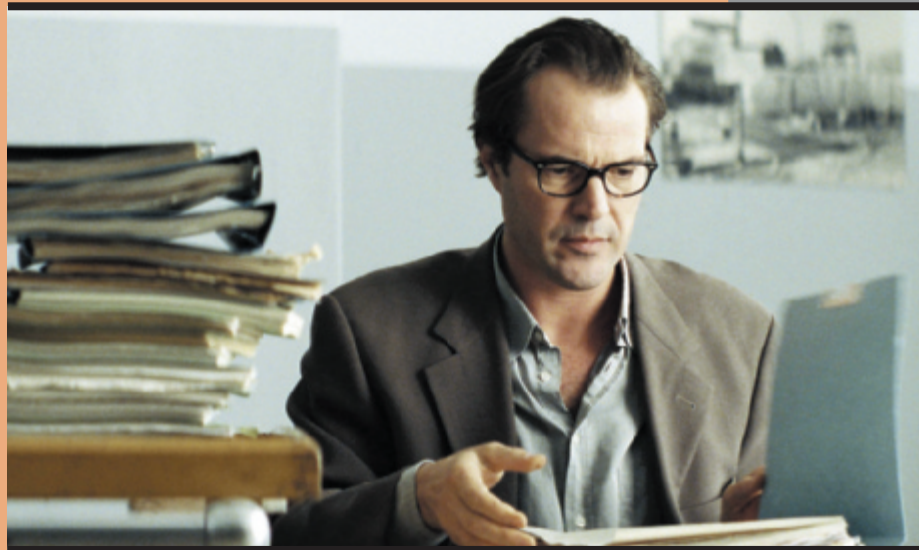
Georg Dreyman (Sebastian Koch) examines his Stasi files.

The Lives of Others has been praised by East Germans for accurately depicting the drab environment of their country and the role of the Stasi in fostering a society riddled by secrecy, fear, and the abuse of power. The dangers of governments that monitor their citizens are apparent and quite relevant in an age of Patriot Acts designed to fight terrorism. The police state is revealed for what it is, a soulless and hollow world with no redeeming features or values.