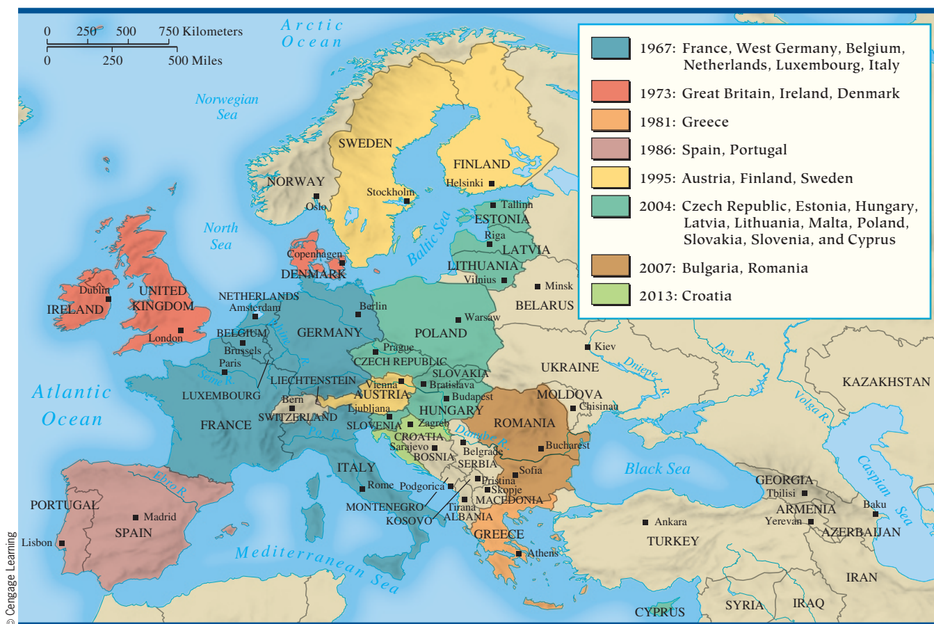
MAP 30.3 European Union, 2013. Beginning in 1967 as the European Economic Community, also known as the Common Market, the union of European states seeking to integrate their economies has gradually grown from six members to twenty-eight in 2013. By 2002, the European Union had achieved two major goals—the creation of a single internal market and a common currency—although it has been less successful at working toward common political and foreign policy goals.