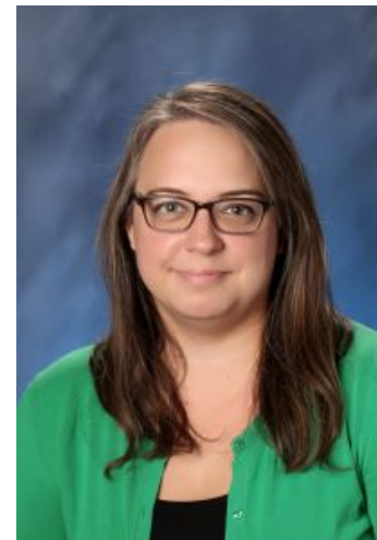
Ms. Olver Resource Room