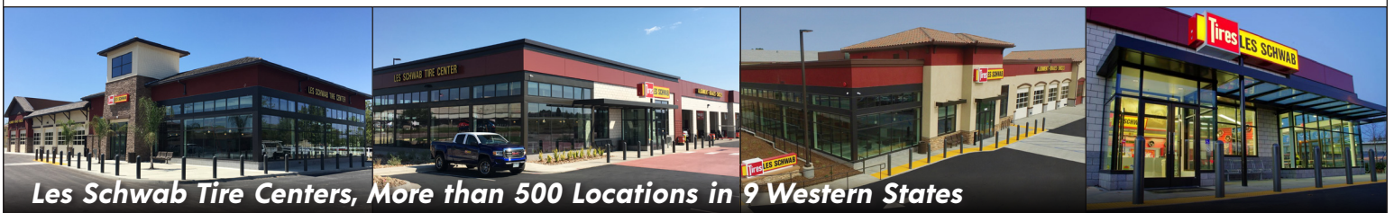
Les Schwab Tire Centers, More than 500 Locations in 9 Western States

Complete information regarding the terms and conditions of these programs can be found in, and are governed by, the official Plan documents and Policies. Les Schwab may modify, amend, suspend or terminate these programs, including any benefits provided there under, at any time and for any reason in its sole discretion.