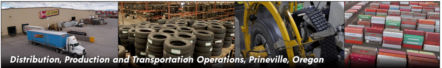
Distribution, Production and Transportation Operations, Prineville, Oregon